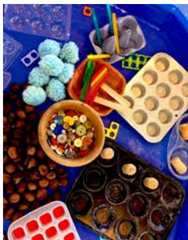
Figure 1: What might play out?

Helen J Williams discusses learning mathematics playfully.